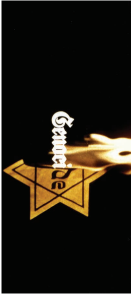
1981 Genocide, documentary film title sequence.