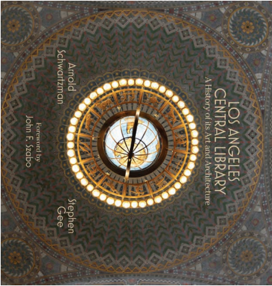
2016 Los Angeles Central Library A history of its Art and Architecture, book jacket.