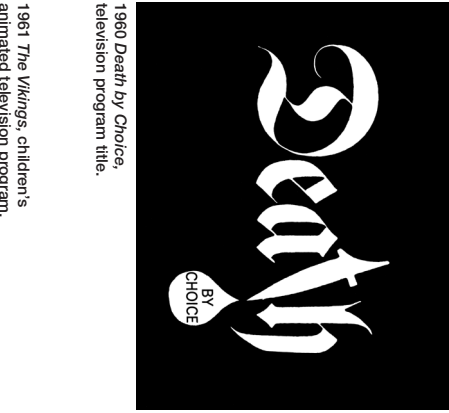
1960 Death by Choice, television program title. 1961 The Vikings, children's animated television program.