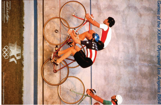
1984 Cycling, Signature Series, Commemorative poster, 1984 Los Angeles Olympic Games.