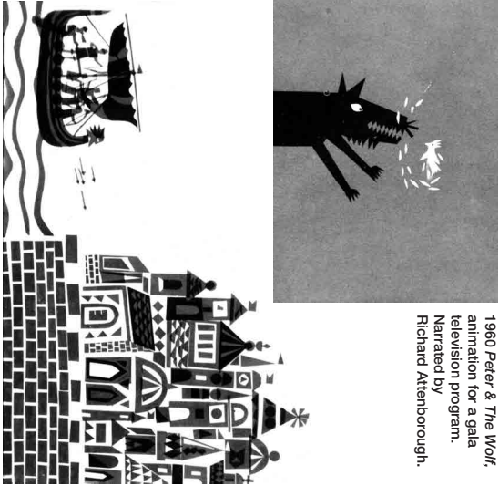
1960 Peter & The Wolf, animation for a gala television program. Narrated by Richard Attenborough.